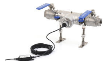
Optional In-flow adaptor