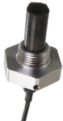
Sensor with debris attached