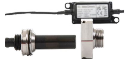
Sensor & electronics