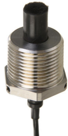
Sensor with debris attached