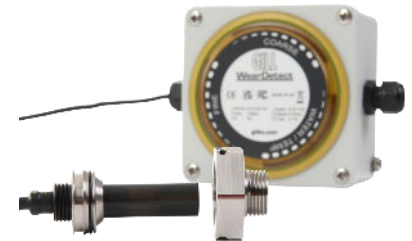
Sensor with display electronics

Supplied with a local display unit, the sensor can be installed into a wide variety of fittings and is available with either a 0-10V, 4-20mA or CAN digital output.