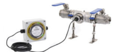
Optional In-flow adaptor