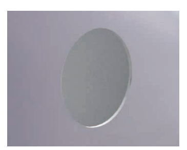
One hole to cut.