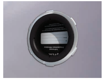
Single PIRma-Lock™ ring nut.