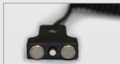
for Portable and 2x models